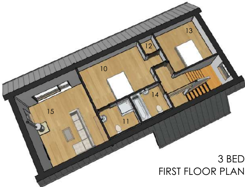
3 BED FIRST FLOOR PLAN